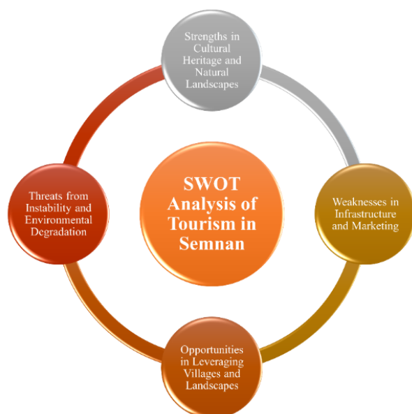
Figure 1: SWOT Analysis of Tourism in Semnan Province

responsible travel behavior, supporting local economies, and fostering community participation, are essential for achieving a balance between tourism development and the preservation of natural and cultural assets [16-17]. By embracing the principles of sustainable tourism and applying the insights from the Social Exchange Theory, destinations can strive for a more harmonious and mutually beneficial relationship between tourists and host communities, thereby creating a more sustainable and positive tourism experience.