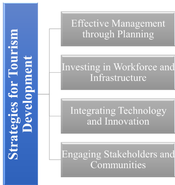
Figure 2: Strategies for Tourism Development in Semnan Province

audience. An effective strategy also considers the integration of technology and innovation to enhance the visitor experience and improve operational efficiency.