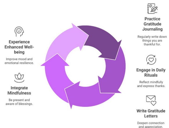
Figure 3: The cyclical process of gratitude practices and their effects on wellbeing

have, as opposed to focusing on what is lacking. This can lead to a profound shift in perspective, fostering a deeper sense of contentment and inner peace. Collectively, these strategies offer practical ways to weave gratitude into daily life, offering both immediate emotional benefits and long-term psychological growth [10].