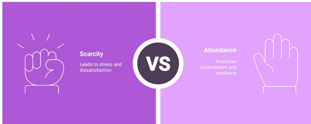
Figure 2: Conceptual diagram of mindset shift from scarcity to abundance through gratitude practices.